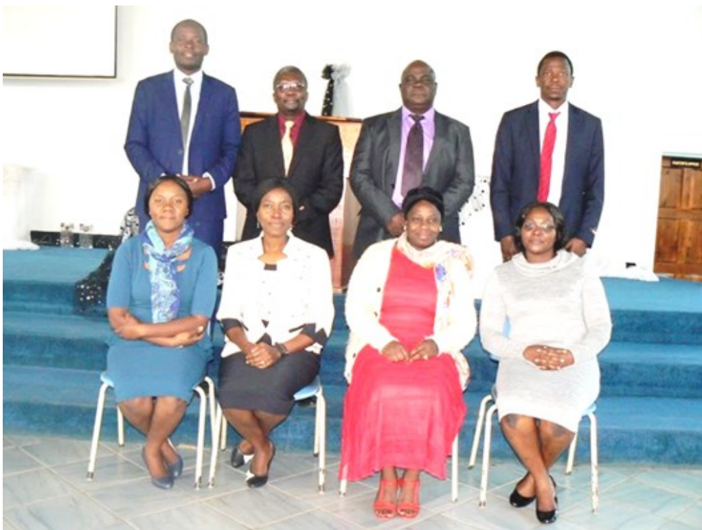
NEC Elders and their Dear Wives