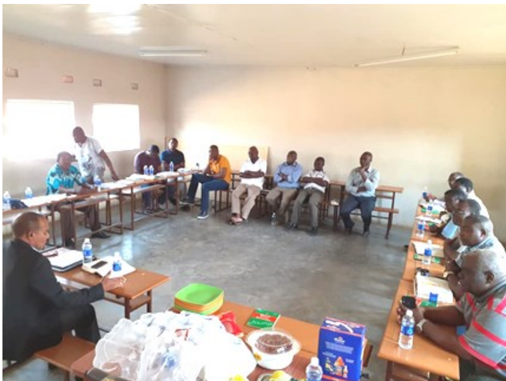
Men's Meeting at NEC