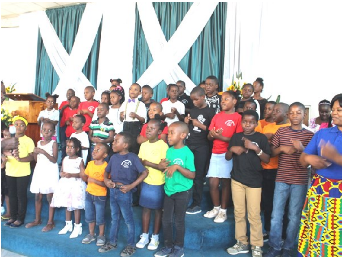
It's a Mixture of Nursery and Older Children. None is too small to give Praise!