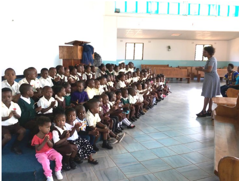
Reaching Out to Children with the Gospel: A Spiritual Emphasis at Nkana East Primary School

Thursday 16 th July, Pray for The Children