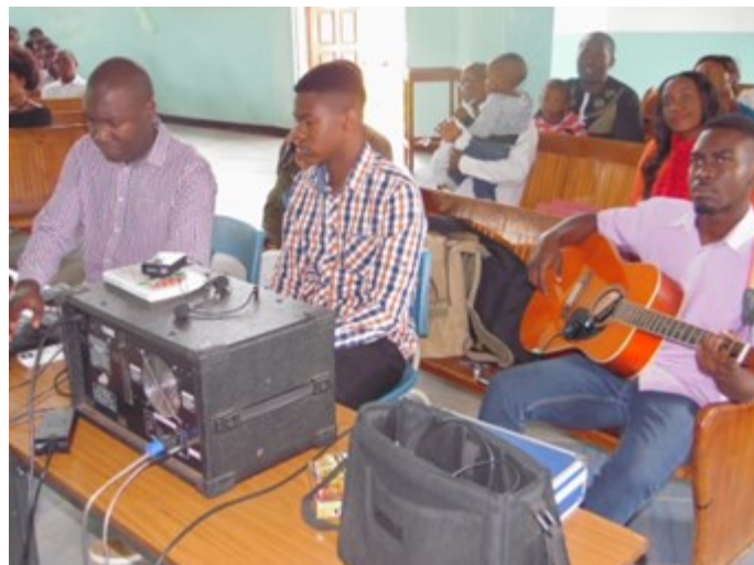
Young Men Active in Media Team