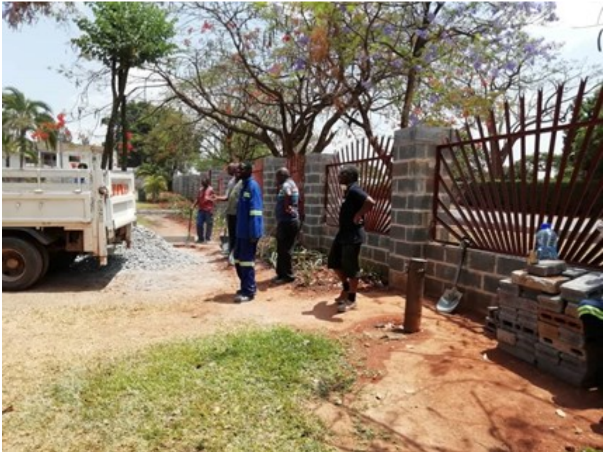
Men Take Up Tough Projects at NEC