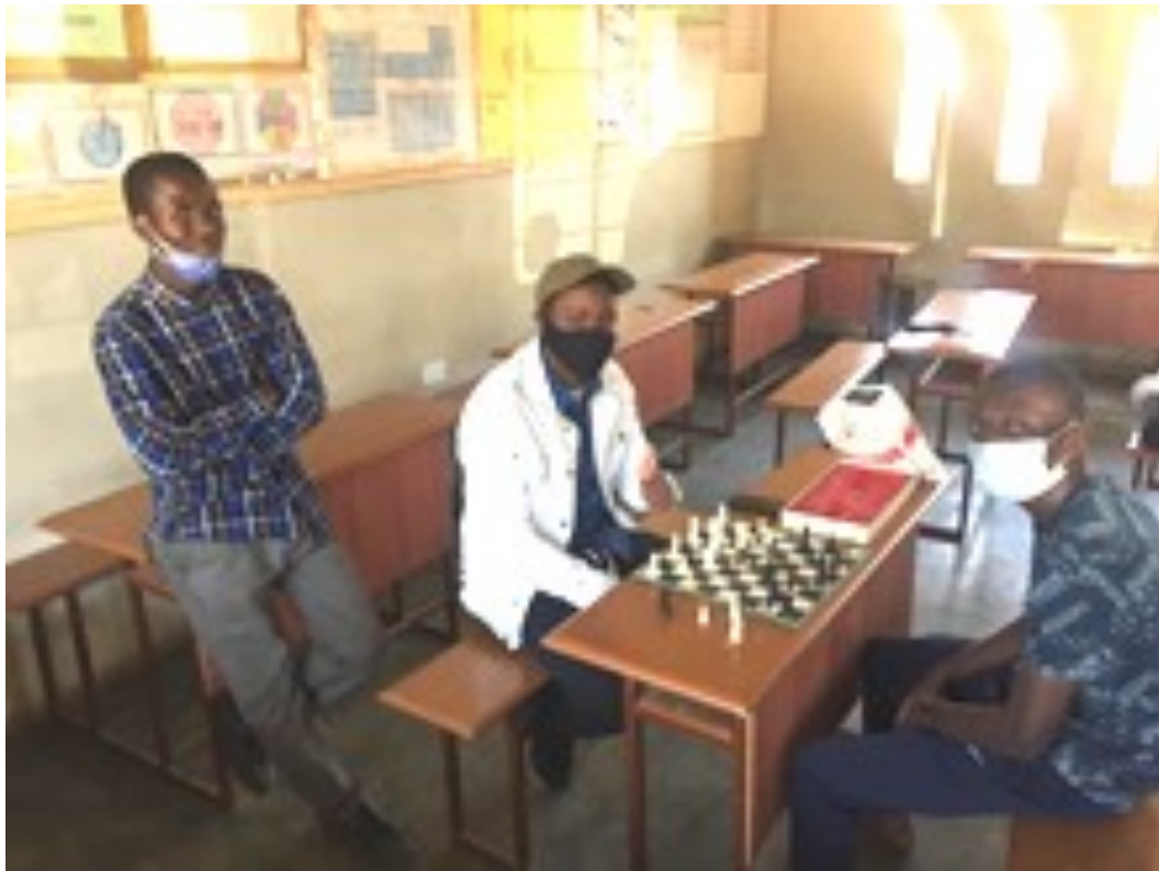
The First Monthly Youth Meeting Since the Covid 19 Lockdown